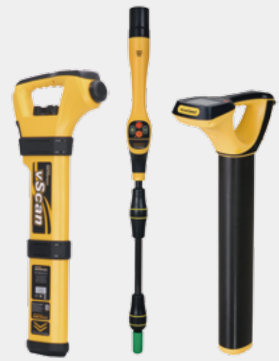
vScan, VM-540 and vLocCam2 Sonde Locators

6981 Eastgate Blvd., Lebanon, TN 37090 / T (615) 285-3952 sales@tracerelectronicllc.com / www.tracerelectronicllc.com