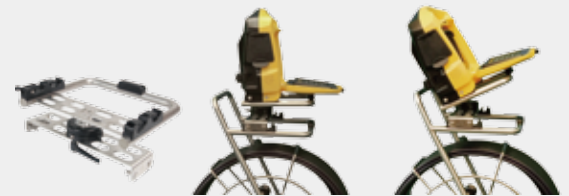
Rotate and Tilt Mounting Table