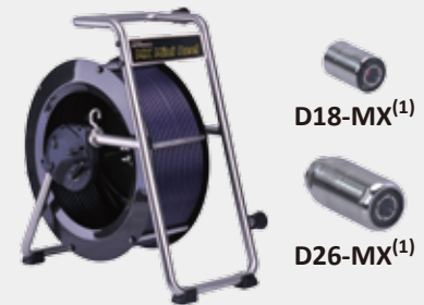
Mini-Reel and Cameras